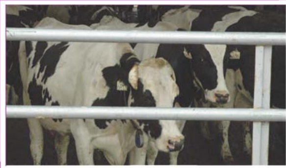
The Cows —You need lots of cows producing lots of manure. The Meissners have about 2,000 cows.