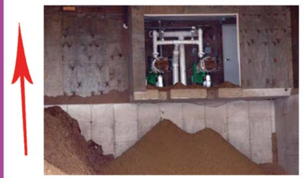
The Byproducts —After the gas has been removed, the water is removed, leaving the best bedding available for the cows. The process starts all over again, with the bedding and manure getting mixed together.