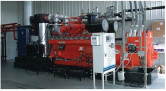
The Generator —After the gas goes to the top of the pit, it is then pumped to this generator to produce electricity. It can generate up to 600 kw of electricity.